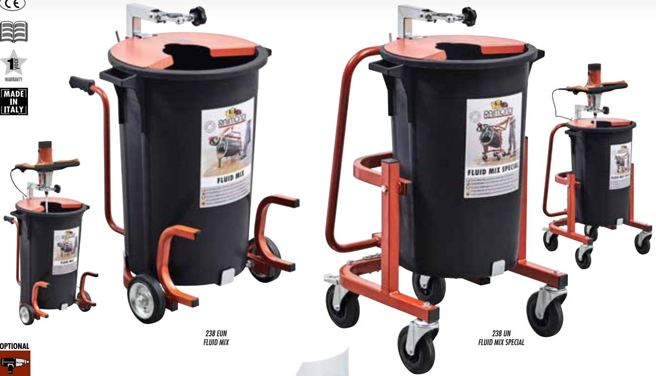
238 EUN FLUID MIX